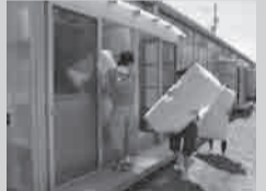
▲Carrying sets of "futon"

There were about 100 volunteers who gathered from three neighboring communities, fire departments, the volunteering club at Fukushima Gakuin University, and the natural disaster volunteering SB Net from Fukushima City. Some joined the activity individually. Under the severely hot weather, everybody smoothly did the work and finished it in about an hour.