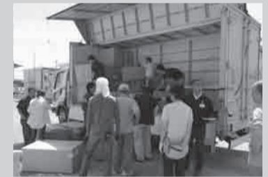
▲Taking out relief goods from the trucks