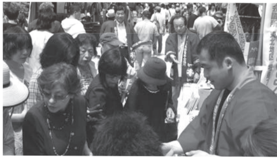
▲“The project to make Fukushima GENKI” sells Fukushima’s special local products. The event has been held in Tachikawa, Hachioji, Yokohama, Omiya, and other cities. (At Yokohama Port Anniversary Bazar)

Our mission is to show vibrant GENKI FUKUSHIMA to the rest of the nation and make more people understand Fukushima.