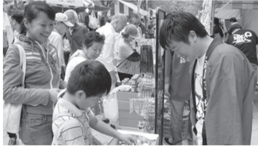
▲“We are so happy to see you so well and GENKI.” “Yes, we are GENKI. Please keep supporting Fukushima.”