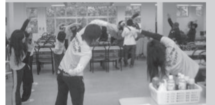
▲At the evacuation center within Fukushima University which was open until April 30th. (April 9th, 2011)