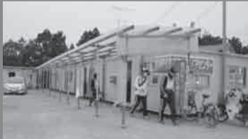
▲ There are five prefabricated houses. The first house is for general affairs, the second house is an information center, the third house is for a needs-matching group, the fourth house is for the reporting of volunteer activities and the fifth house is a materials store.