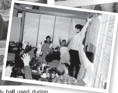
◀ A powerpoint presentation about the Chuetsu Oki Earthquake. It depicts stretching exercises for the people living in temporary housing.