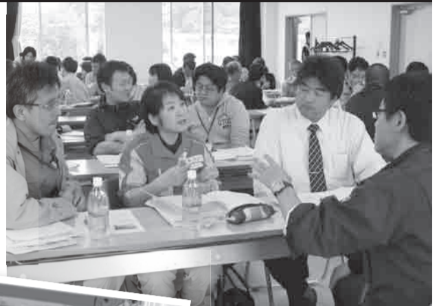
▲Participants expressing their thoughts and questions after the lecture.