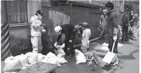
▲The mud is thick and heavy, and digging it out is slow work.