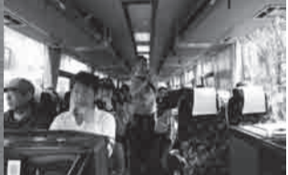
▲With 42 volunteers from across Japan on board, the bus heads to Iwaki.