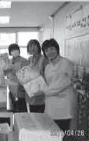
Packs arrive at the Komagamine Nursery