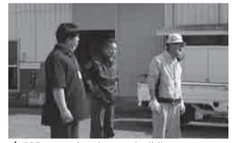
▲"When we're done rebuilding, we want to get back to where we started and make our fish cakes even more delicious," said the factory owner. (Right)