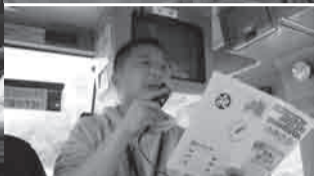
▲Coordinators talk about the proper mindset for volunteering.