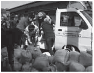
▲The last task for the day is carrying out the mud in bags.