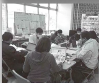
A scene at the Fukushima Disaster Volunteer Center

The Fukushima Disaster Volunteer Center was set up on the first floor of the Fukushima General Social Welfare Center in accordance with the establishment guidelines of the Fukushima Disaster Volunteer Liaison Council (1).